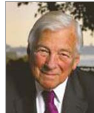
John C. Whitehead Chairman of the Lower Manhattan Development Corporation