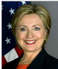
Hillary Clinton Former First Lady of Arkansas