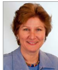
Ambassador Karen Hughes Global Vice Chair Burson-Marsteller