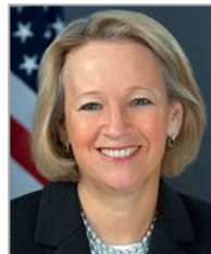
Mary L. Schapiro Chairman Security and Exchange Commission