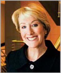
Anne M. Mulcahy Chairman and CEO Xerox