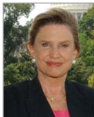
U.S. Congresswoman Carolyn Maloney (D-12-NY), Senior Member, House Financial Services Committee; Ranking Member, Subcommittee on Financial Institutions and Consumer Credit