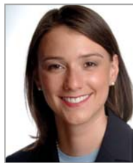
Jessica Lappin New York City Council District 5 – Council Member – Democrat