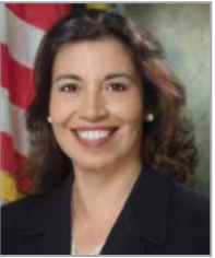
Anna Escobedo Cabral U.S. Treasurer