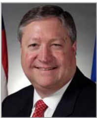
Michael B. Donley Secretary of the U.S. Air Force Washington, D.C.