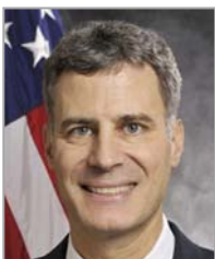
Alan B. Krueger Chair, White House Council of Economic Advisers