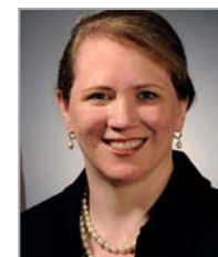
Erin C. Conaton Undersecretary of the U.S. Air Force