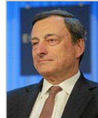
Mario Draghi Vice Chairman and Managing Director Goldman Sachs International