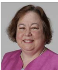
Liz Krueger New York State Senator (D-WF) 28 th Senate District