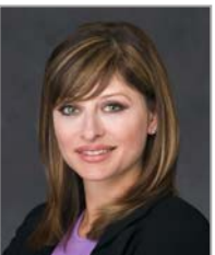
Maria Bartiromo Anchor, CNBC's "Closing Bell" Anchor/Managing Editor "Wall Street Journal Report with Maria Bartiromo"