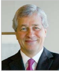
Jamie Dimon Chairman and CEO JPMorgan Chase & Co.