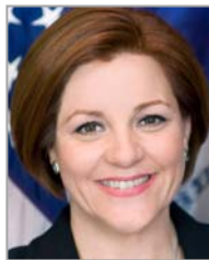
Christine C. Quinn New York City Council Speaker District 3 – Council Member – Democrat