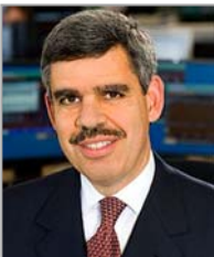
Mohamed A. El-Erian CEO and Co-CIO PIMCO