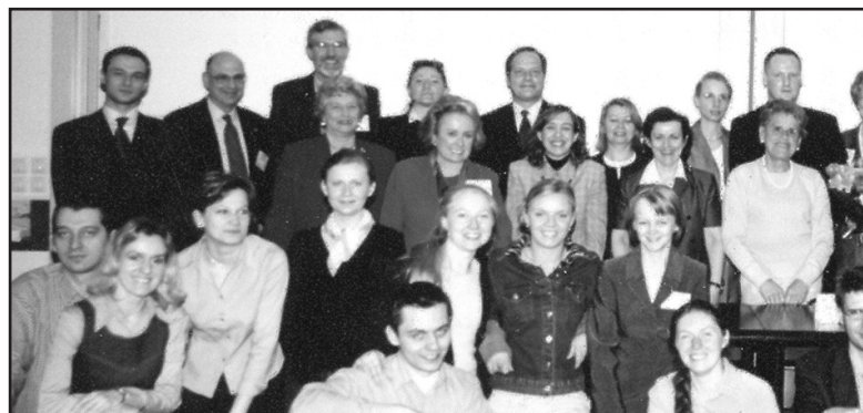
FWA MEMBERS MEET WITH STUDENTS AND FACULTY IN MBA PROGRAM AT THE BUSINESS SCHOOL