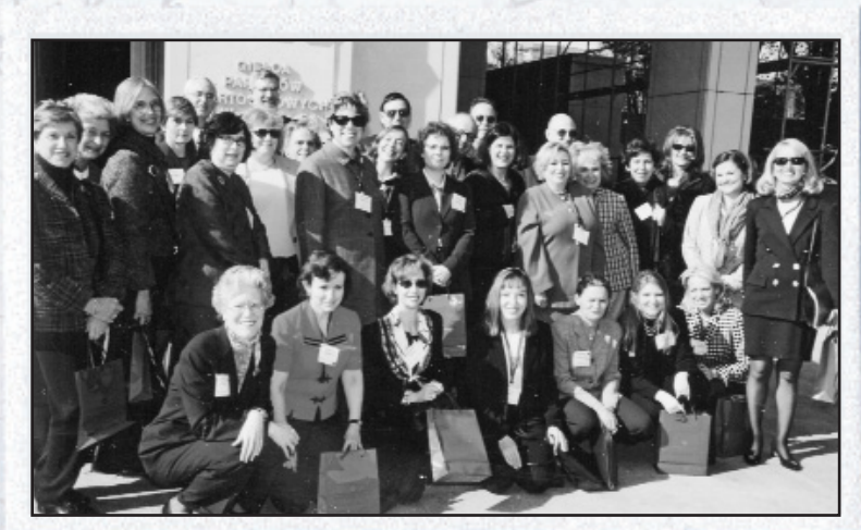
2002 FWA Delegation in front of the Warsaw Stock Exchange