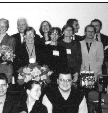
THE WARSAW POLYTECHNIC UNIVERSITY