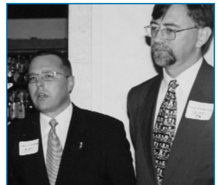
SALANS POLAND PARTNERS