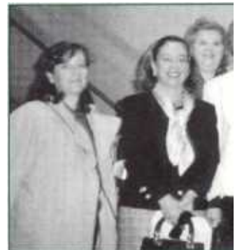
The FWA International Affairs Conference