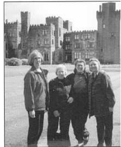
Delegates at Dromoland Castle