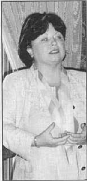
Deputy Prime Minister Mary Harney shared insights on investing in Ireland