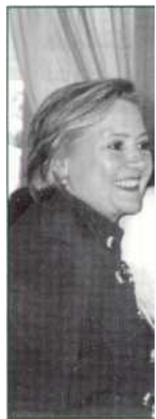
U.S. Ambassador to Ireland reception