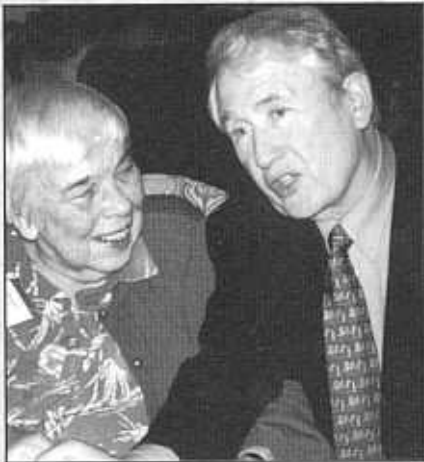
Frank McCourt, author of Angela's Ashes , was the speaker at the opening dinner