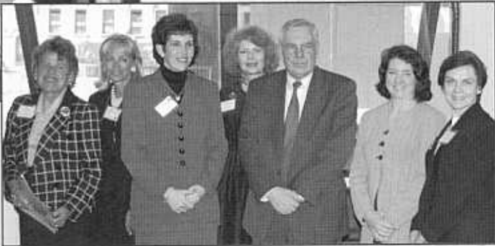
Central Bank of Ireland briefing