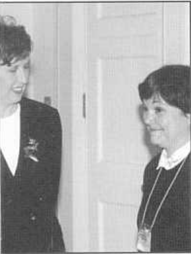
and FWA presidents compare notes