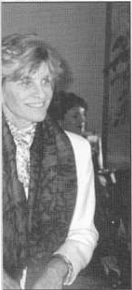
Jean Kennedy Smith hosted a job White House