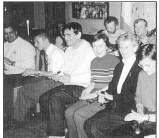
Impromptu concert featured delegates