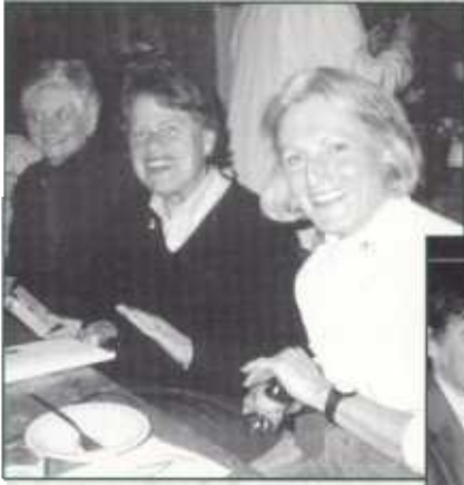
Enjoying more Irish hospitality