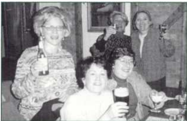
Sampling traditional beverages at the Irish Pub night