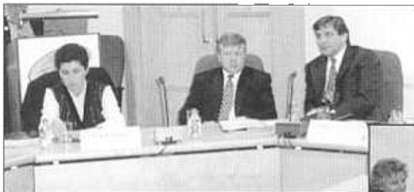
A presentation on "Ireland: Europe's New Banking Center" at the Financial Services Industry Association