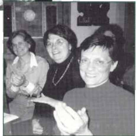
Irish dancing brought a round of applause