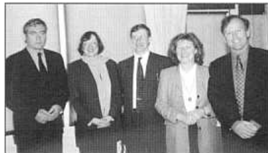
Panel members discussed "High Growth — High Tech."