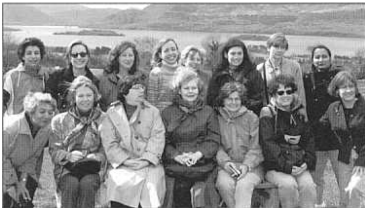
Atop the Cliffs of Moher — a spectacular setting