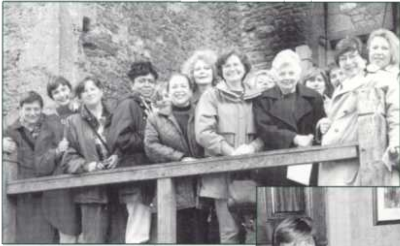
Waiting to tour medieval Bunnratty Castle