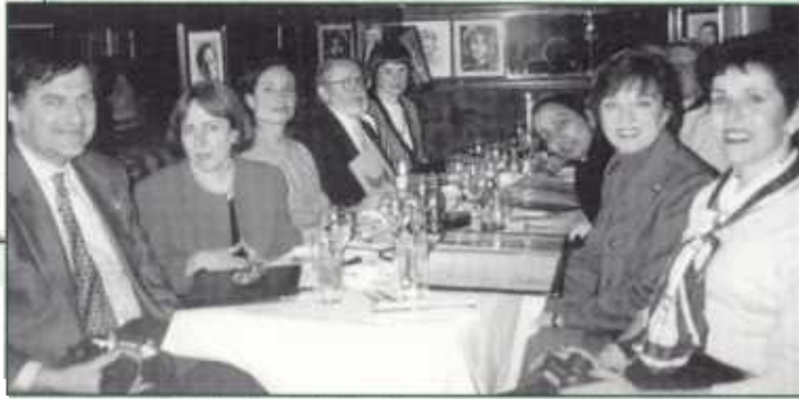
Dining in one of Dublin's very fine restaurants.