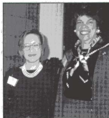
Delegates at Dromoland Castle