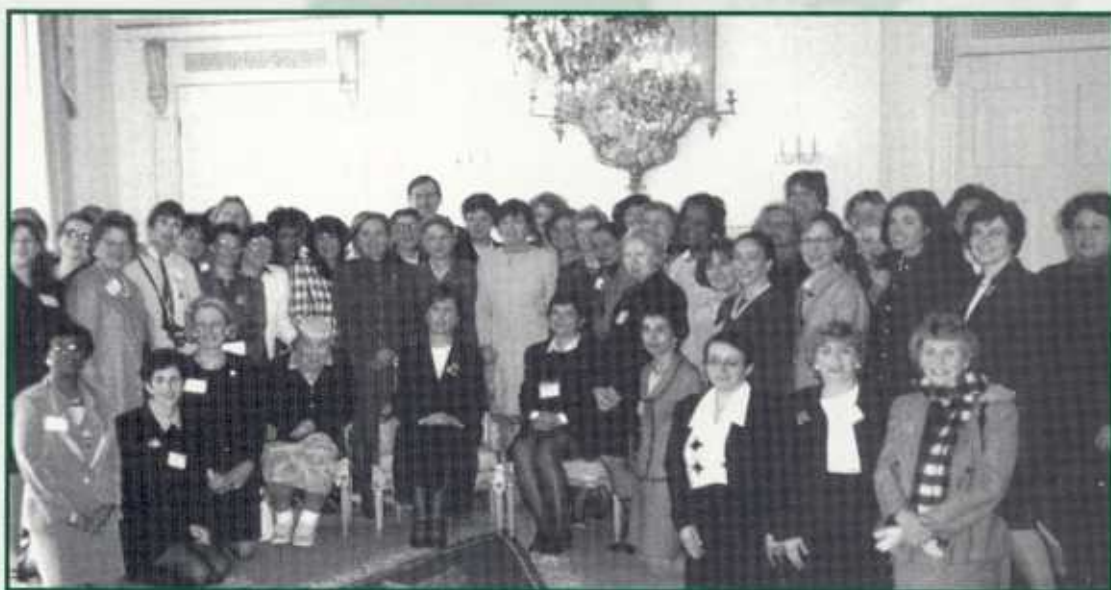
The delegation met with Mary McAleese, President of Ireland, at her residence

14 TH ANNUAL INTERNATIONAL CONFERENCE APRIL 24 - MAY 2, 1998