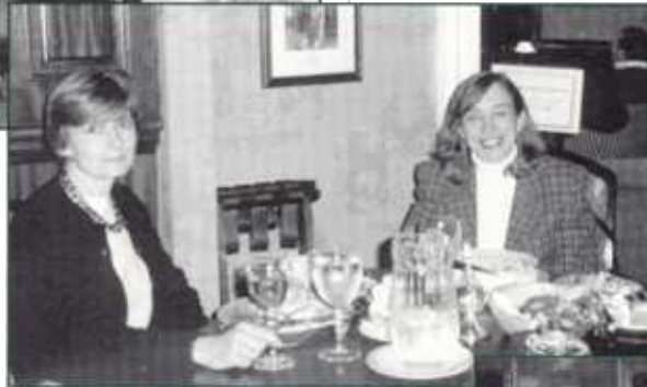
Sharing impressions at the end of a busy day