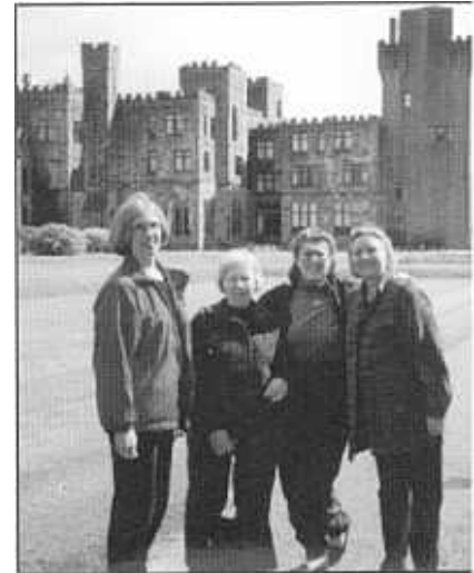
Delegates at Dromoland Castle