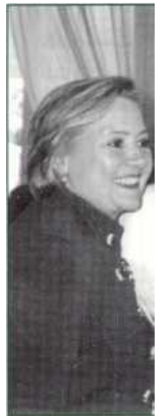
U.S. Ambassador to Ireland reception