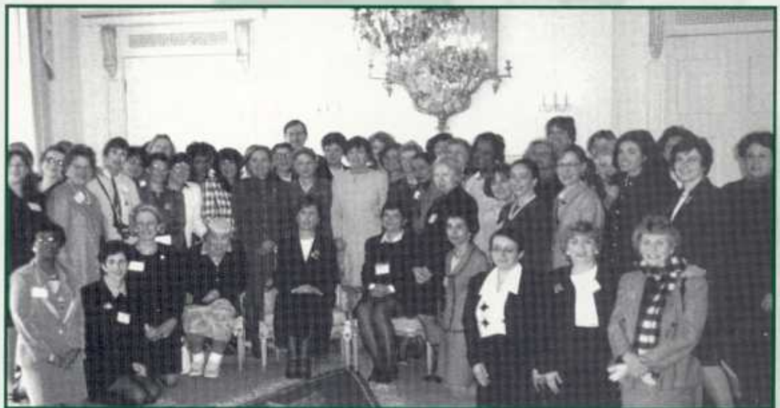
The delegation met with Mary McAleese, President of Ireland, at her residence

The FWA wishes to express its sincere gratitude to the following Sponsors for their generous support of the 1998 International Conference in Ireland.