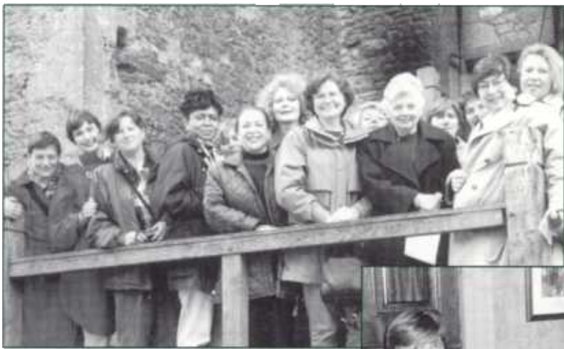
Waiting to tour medieval Bunnratty Castle