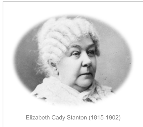
Elizabeth Cady Stanton (1815-1902)