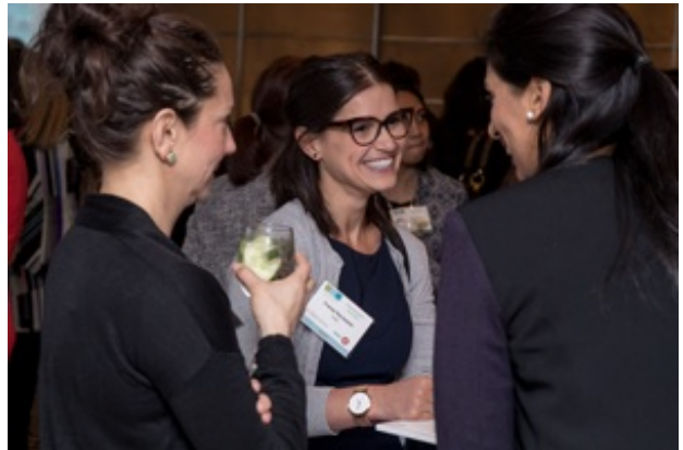
Members and guests enjoy networking