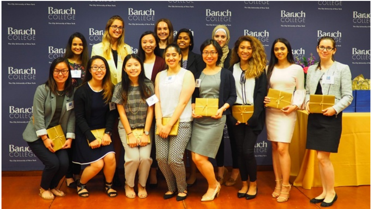
The FWA Mentees at Baruch College