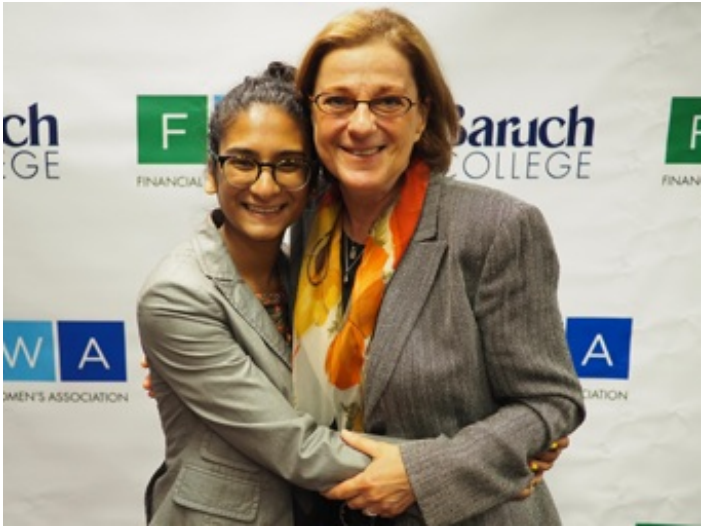
Mentor and Mentee friends for life