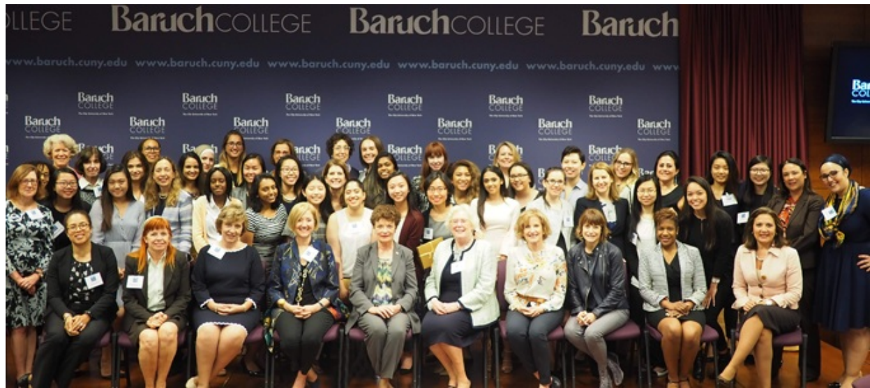
FWA Mentors and Mentees